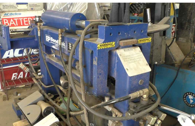
The infamous Exhaust Pipe Bender.