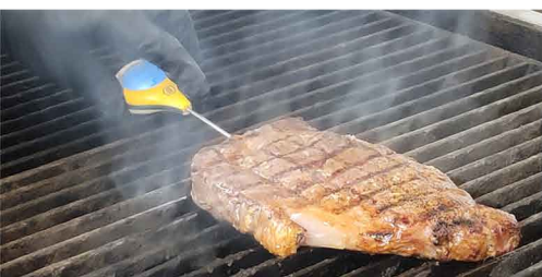
Getting the temperature just right on a Ribeye steak.